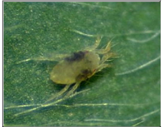
Fig. 2. A Twospotted spider mites on a strawberry leaf.