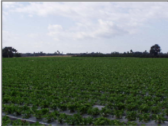
Fig. 1. Field strawberry production under way. Healthy young strawberry plants in raised beds and plastic mulch.